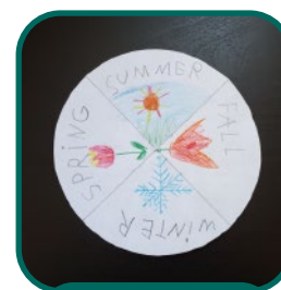
Steps 5 & 6