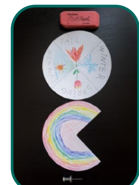
Steps 7 & 8