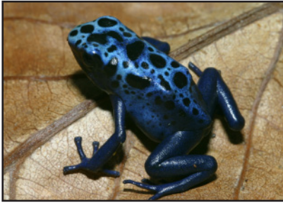
Dendrobates tinctorius (blue poison frog)

Frog Fact: The most poisonous dendrobatid, golden poison frogs are also excellent "tongue hunters," rarely missing a strike.