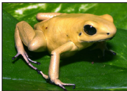
Phylllobates terribilis (golden poison frog)

The Emberá used three frog species to poison their darts. One of these species was a bright yellow or sometimes orange frog that the scientists had not seen before. Over several years, they collected hundreds of this new-to-science species. The frogs were about two inches long, larger than any other species of poison frog.